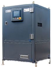
High Speed Turbo