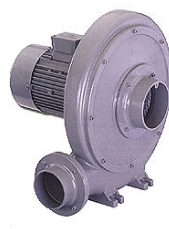
Low Speed Turbo