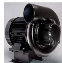
Direct Drive Turbo

CALL TOLL FREE 1-877-610-8876 FOR YOUR FREE PLANT ASSESSMENT